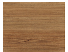
Pure Almond FZNX0012/EA