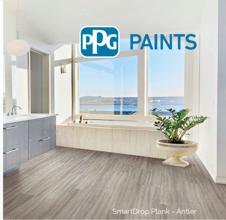
SmartDrop Plank - Antler