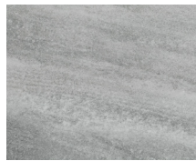
Grey Granite FZNX0022/EA