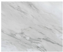
Carrera Marble FZNX0023/EA