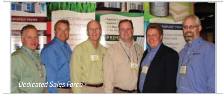
Dedicated Sales Force