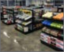
Business Development Fund best uses