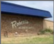
eDealer Interview with Roberts Decorator Supply