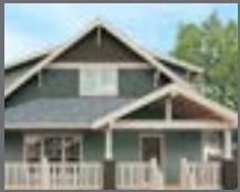
Product highlight: PPG BREAK-THROUGH!®